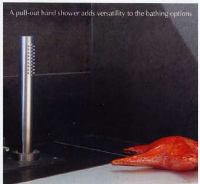
A pull-out hand shower adds versatility to the bathing options