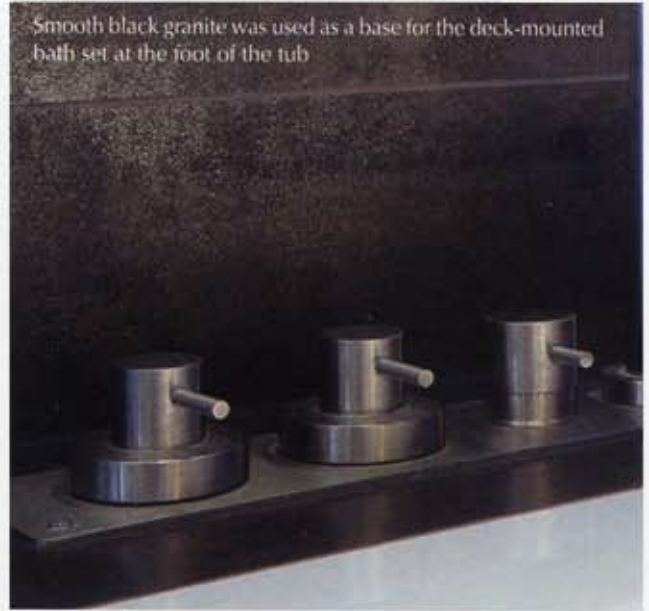
Smooth black granite was used as a base for the deck-mounted bath set at the foot of the tub